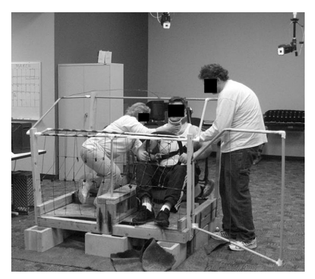
Figure 1. Application of the cervical collar by Emergency Medical Services personnel in the mock automobile. Visual monitoring cameras recording head and trunk movement of victim.

were extricated from the vehicle. The remaining six participants were students who knew little about the process of extrication. They portrayed drivers and were extricated from the vehicle by the EMS pairs. Ten participants were an adequate number to generate data for a power analysis for a future investigation. The study was approved by the Institutional Review Board. Written informed consent was obtained from all participants.